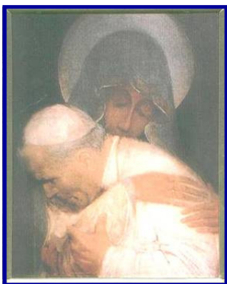
Servant of God John Paul II Pray for Us!

SAVE THE DATE & PARTICIPATE in our Hawaiian Knight Summer Dance! Saturday — June 11, 2011 @ La Villita Assembly Hall